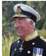
Sir Fabian Malbon Lieutenant Governor